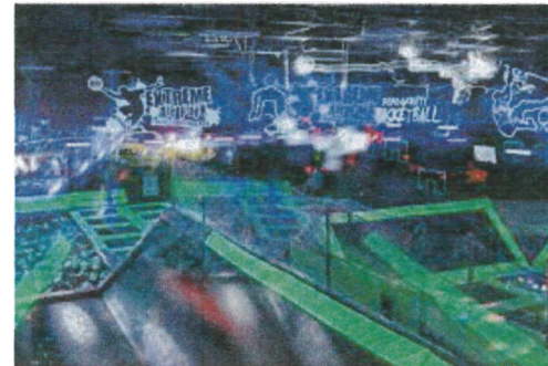
Extreme Air Park

Ride the sky train to Extreme air park then travel on to a sleepover planned by BC Youth Forum